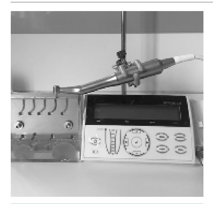
Figure 1. Test setup with stainless steel root canal used in the experimental study.